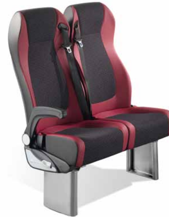
1 - Seat upholstered in double tone and double material trimming, operator logo serigraphy on armrest aisle side plaque.