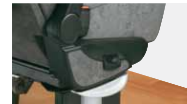
• Widening device

Folding down aisle side armrest, and central armrest can feature the following stylish effects: