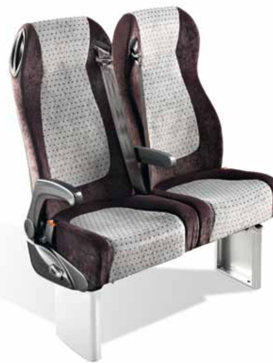
3 - Seat upholstered in microfibre, patterned to the centre of quab and cushion, filler to the sides, with central armrest, carbon effect on armrest and side grab handle.

Create your own seat and personalize your colour combination by choosing from Politecnica's collections of microfibre and leather