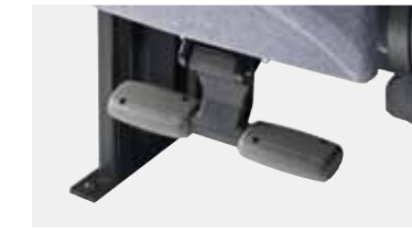
• Adjustable footrest (2 positions)