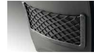
• Plastic magazine net