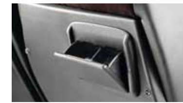
• Ashtray/ small wastebin