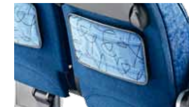
• Magazine pocket