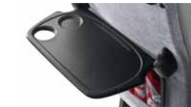
• Folding rear table in plastic