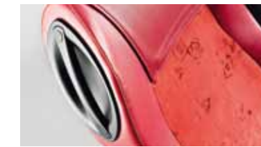
• Side grab handle

Create your own seat and personalize your colour combination by choosing from Politecnica's collections of microfibre and leather