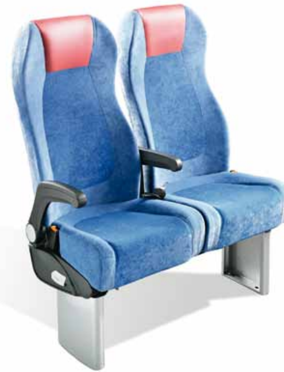
2 - Seat upholstered in microfibre, patterned to the centre of squab and cushion, filler to the sides, headrest insert in Leather, and central armrest.