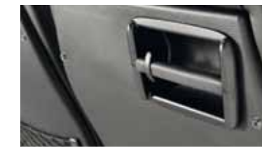
• Rear grab handle and coat hook