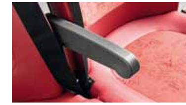
• Folding up-down central armrest