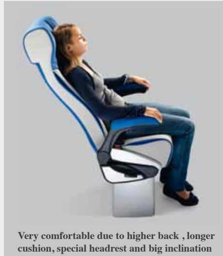
Very comfortable due to higher back , longer cushion, special headrest and big inclination