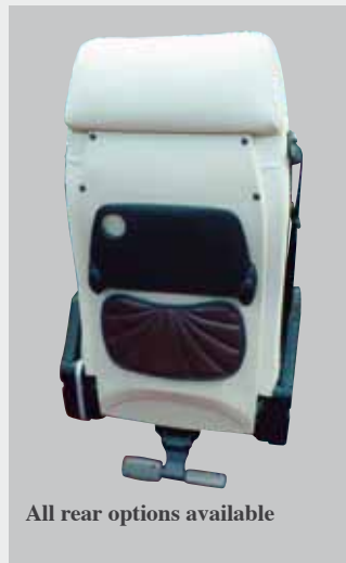
All rear options available