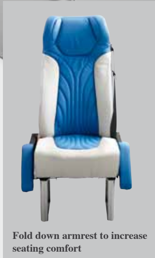
Fold down armrest to increase seating comfort